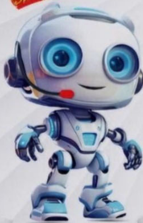
Our Conversational Bot w/Chat GPT-4